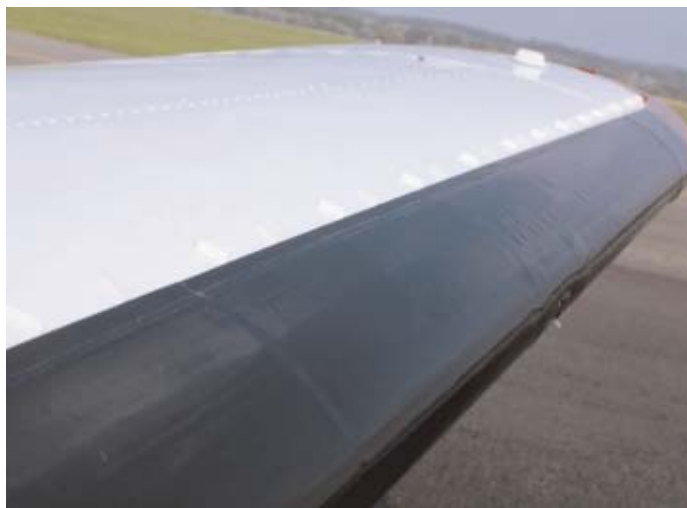
Pneumatic boots shown on leading edge of wing