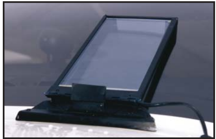
Non-hazard: Electrically heated windshield

In addition, there is no requirement to have a heated stall warning sensor, so a stall warning system may not be reliable in icing conditions.