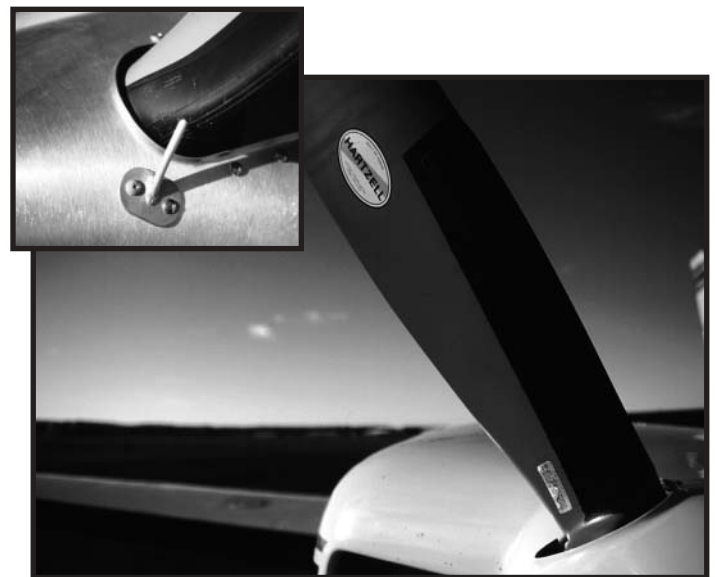
Non-hazard: Alcohol (inset) and electrically heated prop anti-ice equipment

Non-hazard systems must show in dry air that installation of the system does not affect performance, stalls, controllability, stability, trim, ground/water handling, vibration and buffet, and if applicable, high speed characteristics. There is no requirement to evaluate these characteristics in icing conditions. The certification requires the airplane and essential systems be protected against catastrophic effects from lightning. All electrically operated components must be electrically bonded to prevent electromagnetic interference. A non-hazard ice protection system is not considered an essential system.