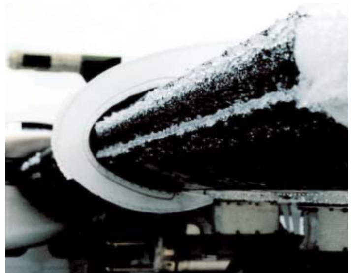
Clear ice formation on wing

No airplane made today can handle every possible icing condition, a fact that most IFR-qualified pilots know well. But airplanes equipped with systems approved-for-icing-conditions may take off unless severe icing conditions are forecast. These systems have been proven to be effective in common icing conditions and are capable of providing pilots with “wobble room” to escape to safety when icing is encountered.