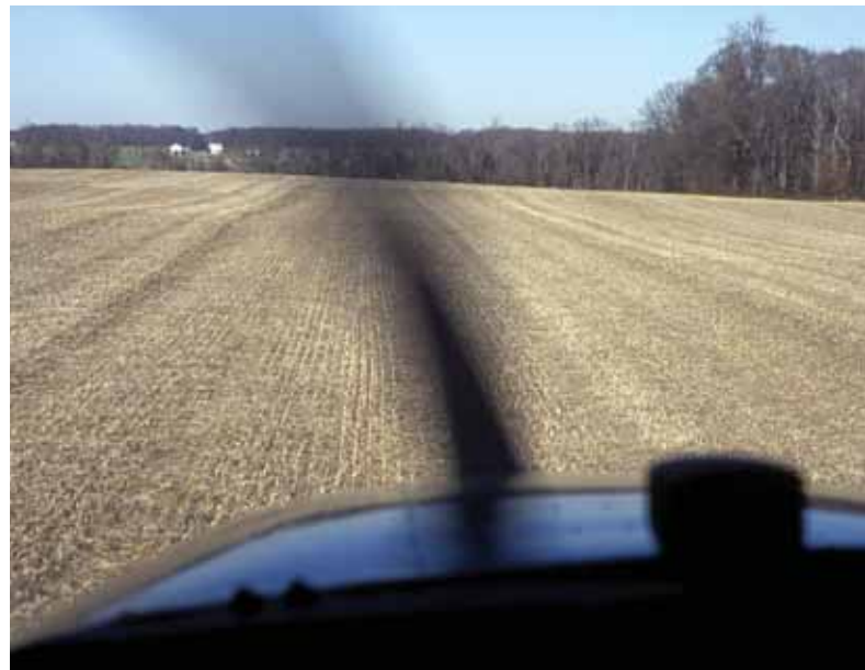
The moment of truth. Low airspeed is preferable in off-airport landings, but don’t stall the airplane trying to achieve the slowest possible touchdown.

Having chosen a landing spot, it’s time to make sure that the aircraft and its occupants are prepared for the landing.