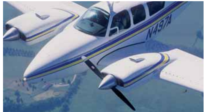
Feather the "dead" propeller in a twin after verifying that the engine has indeed failed. At low altitudes or airspeeds, it may be necessary to feather immediately.

Propellers are another issue. A windmilling propeller adds drag, decreasing the glide performance of the aircraft. In most multiengine aircraft, pilots can solve this problem by feathering the "dead" propeller. Pilots of single engine aircraft don't have that option, but if the airplane has a constant speed propeller (and enough oil pressure), putting the propeller control in the low-rpm (aft) position will increase the blade angle and in many cases give a noticeable improvement in glide performance.