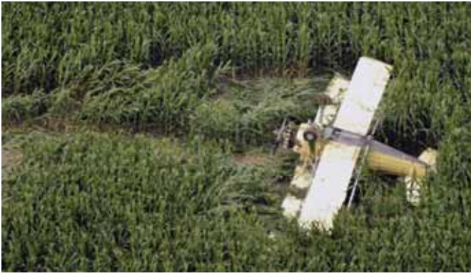
This crop duster came to grief after a forced landing in a cornfield. If possible, avoid fields with tall crops.