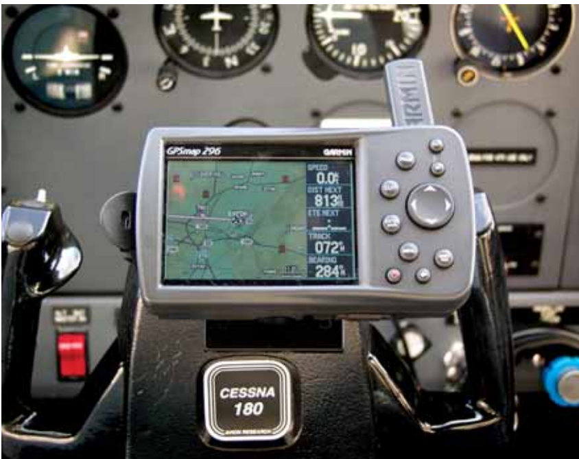
Although not legal for navigation under IFR, a hand-held or yoke-mounted GPS receiver can be useful in maintaining situational awareness.

ances, tunes radios, etc. Altitude-hold and coupling features are wonderful added benefits, but even a basic wing leveler is much better than nothing. Fatigue is very much a consideration in SPIFR. Long flights in tough weather where the pilot must not only manage the system and hand fly the aircraft raises the risk level. Single-pilot charter flights are required by the regulations to have a fully functional autopilot for IFR dispatch. While it's not required for personal flights under FAR Part 91, it's a very good idea.