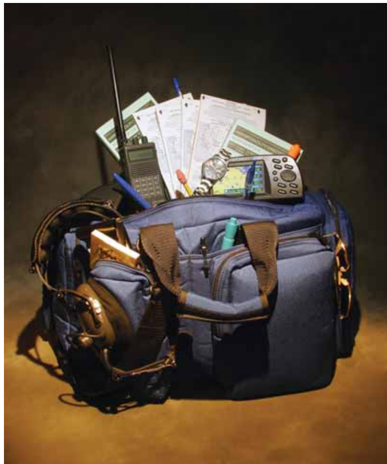
More is not necessarily better when it comes to flight gear and pilot accessories.

at least a yoke-mounted GPS as a supplement to the approved IFR equipment. (No yoke-mounted GPS unit is approved for use as a primary navigation unit for any required IFR GPS or DME functions.) Here are some other items that can greatly reduce your workload and are highly recommended for SPIFR: