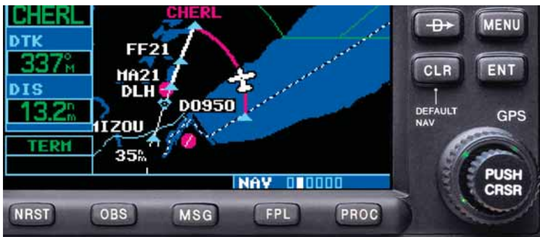
Beat the rush! Any programming you can do on the ground frees up time in flight for other tasks.

We offer two suggestions: Get an experienced IFR pilot (not necessarily an instructor) to walk you through the planning process. Take notes so you remember how it's done. Secondly, plan a trip at least once a week for several weeks,