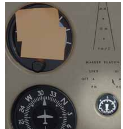
A failed attitude indicator can be fatally distracting. Cover it up with Post-It® notes.